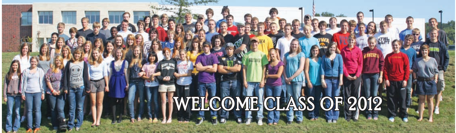
Welcome to new alums from the Class of 2012. Approximately 92 seniors graduated May 27th.