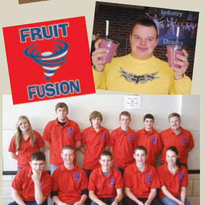
High School 'Fruit Fusion' entrepreneurs