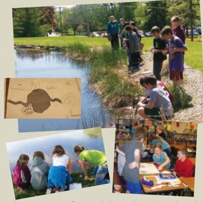
These are pictures of Mrs. Poduska's students trek to Ink Pond. What excitement! The poster is a completed land use map of "Dragonfly Pond" and the classroom picture is of the collaboration of a group in designing that land use. We will also look at rainforests and students will make clay models (brilliantly colored) of the insect/ amphibian/plant they "discover" as a new species which solves a major health or environmental problem facing us today.