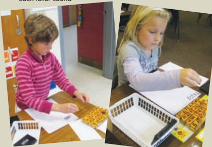
2nd grade students now have a variety of materials that offer different ways to work on spelling words and word