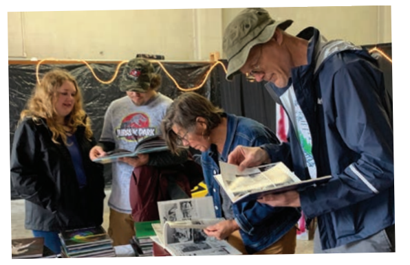
Yearbooks on display at the Alumni-Community Reeption held in the old firestation are always popular!